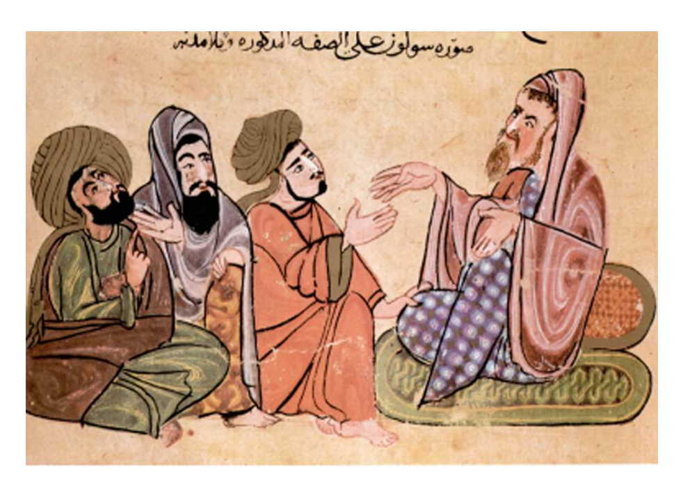
Fig. 3. Solon speaks to the Islamic wise men (from Papadopoulo 1976).