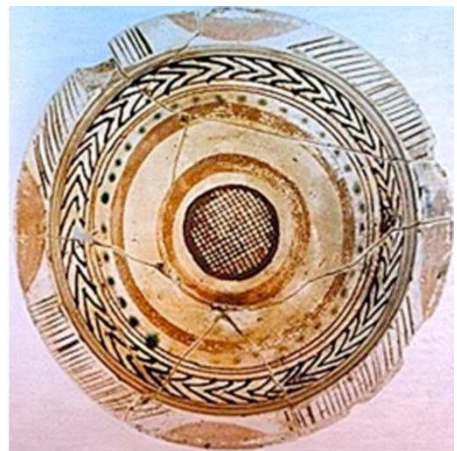
Fig. 1. Pottery with Islamic influence (XII Century) found in southern Italy.