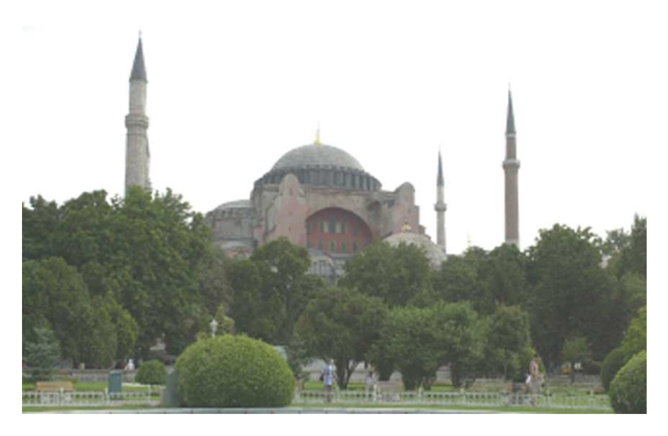
Fig. 6. Istanbul, Haghia Sophia.