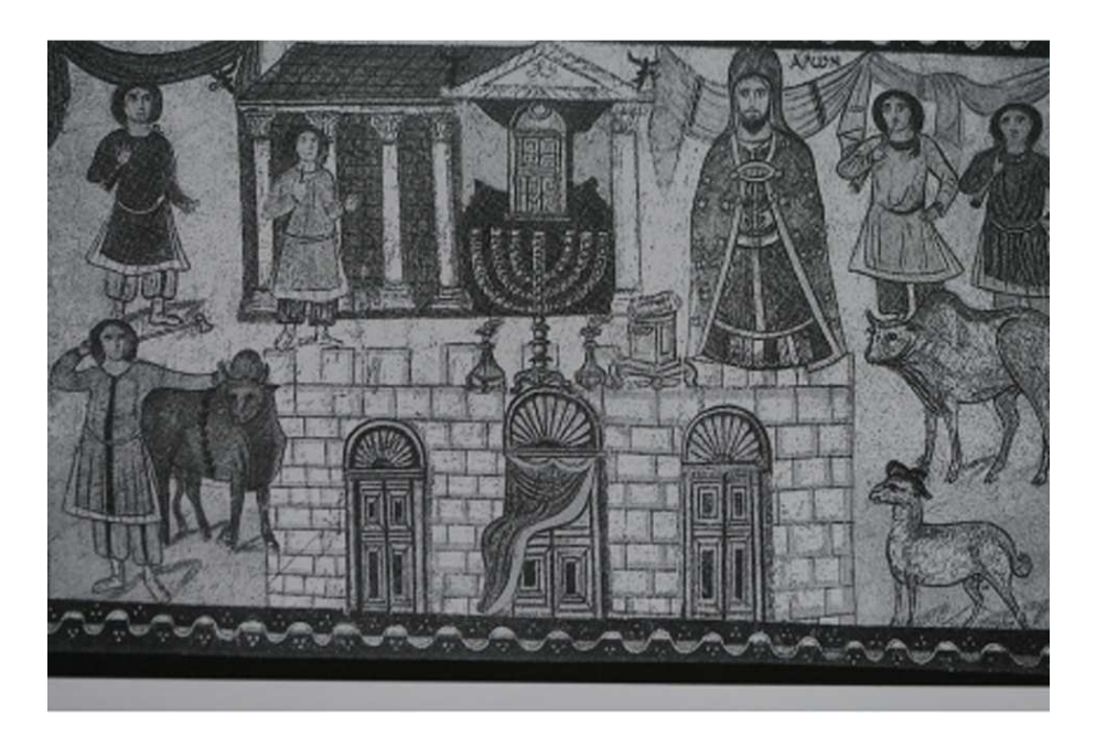
Fig. 2. Damascus, Archaeological Museum: Mosaic with Menorah and a Greek inscription (Aron).