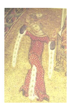
Fig. 9-11. a) Palermo, Sicily, Palatine Chapel: The female dancer; b) Tursi, Santa Maria d'Anglona, Italy: Eve bringing food to Adam; c) Venice, Italy San Marco Chapel: Salome' with the chopped head of Saint John.