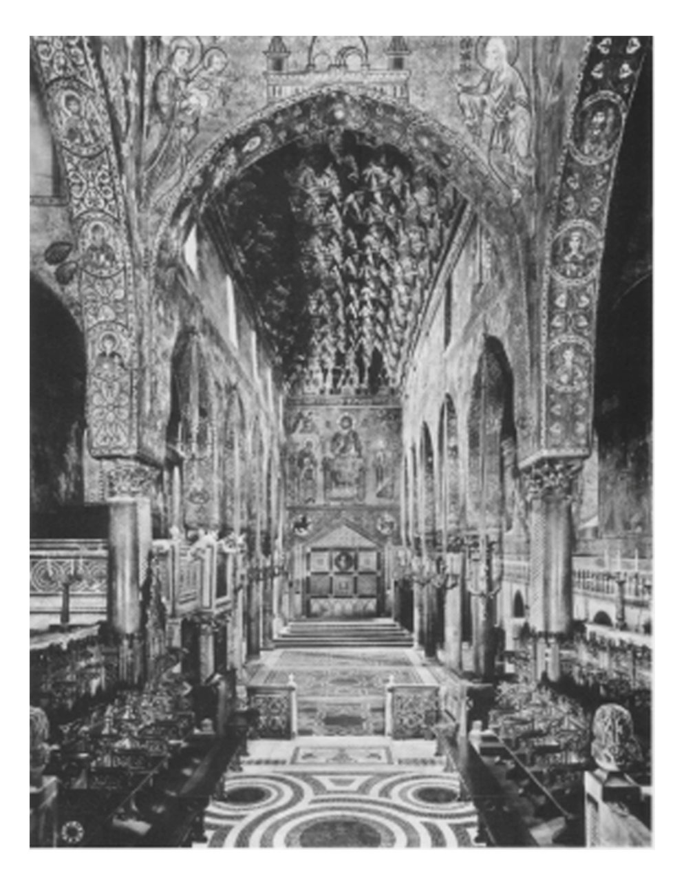
Fig. 8. Palermo, Palatine Chapel.