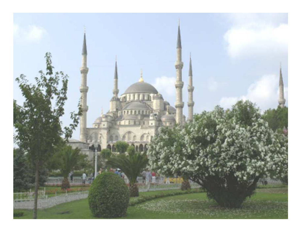
Fig. 7. Istanbul, Suleymanye Mosque.